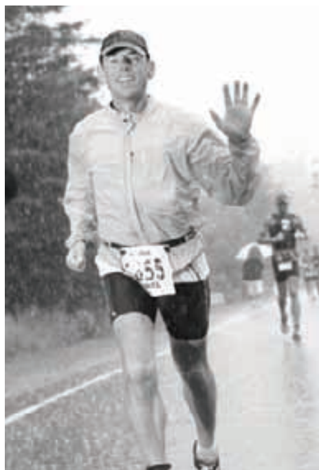
The Iron Friar